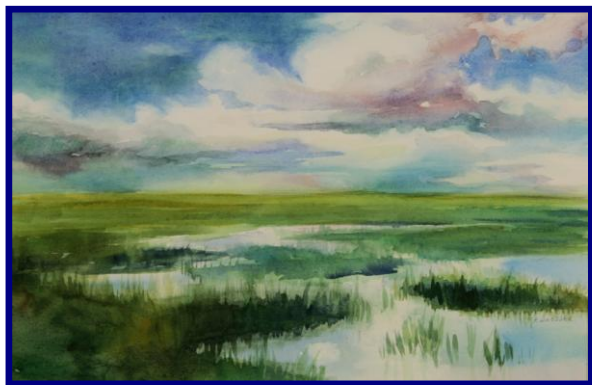
Peggy Dressel. New Jersey Marsh . Water color.

(See course description in the Adult Classes next section.)