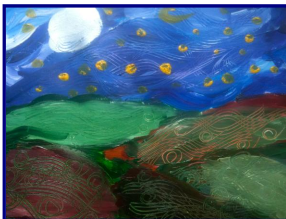
Starry . Acrylic paint worked with various tools.

ences and projects Miss Nina has in store for you. Art materials and techniques will involve pastel, watercolor painting, drawing, and collage.