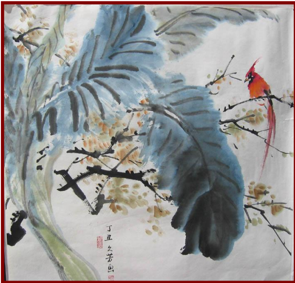
Diana Kung. Red Bird.

Students will learn the use of ink, colors and simple brush strokes to create images of objects found in nature. Learn the various techniques of this freehand brush work that has been used to create beauty in one of the oldest painting traditions in the world.