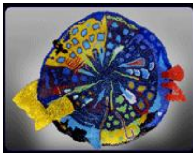
Donna Lish. Spectral Quake . Glass beads.

Beading a spiral form in peyote stitch provides a spontaneous repetition where the artist has options in directing motif. Students will practice this technique using size 8 or 6 seed beads, resulting in a circular sample. There will be the opportunity of starting an additional form where the focus is size and pattern for a finished wall piece, decorative element, or jewelry accent. The glass beaded surface glistens as each row enhances that which preceded, in meditative continuity – the pattern revealed within the maker's unique design decisions.